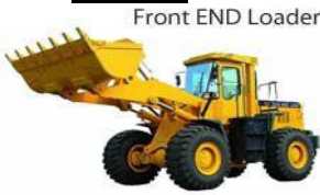
Front END Loader